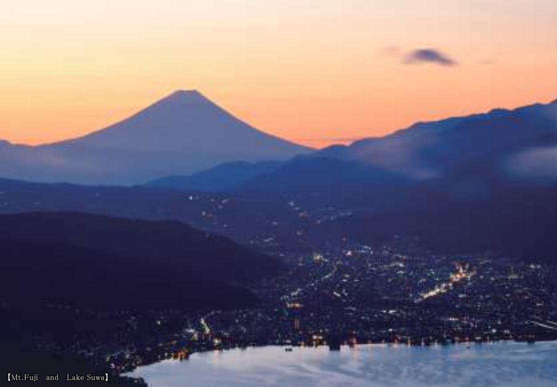
【Mt.Fuji and Lake Suwa】